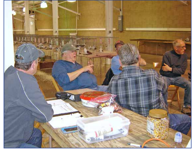
USC Annual Meeting