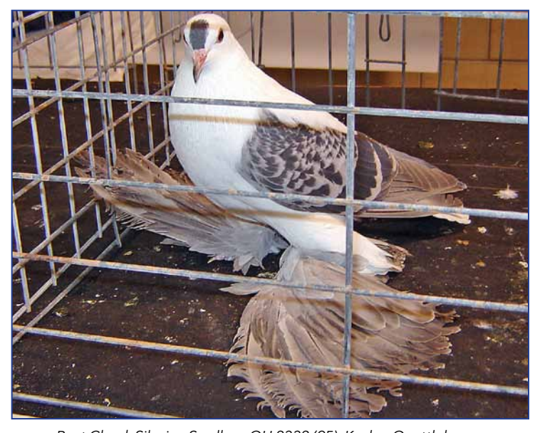
Best Check Silesian Swallow, OH 2332 (95), Kaylee Quattlebaum