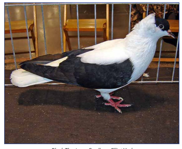
Black Thuringer Swallow, Elliot Yeske