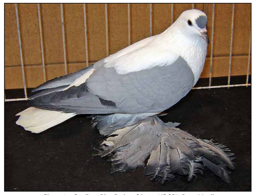
Champion Swallow: Blue Barless Silesian YC 256; Perry Mueller