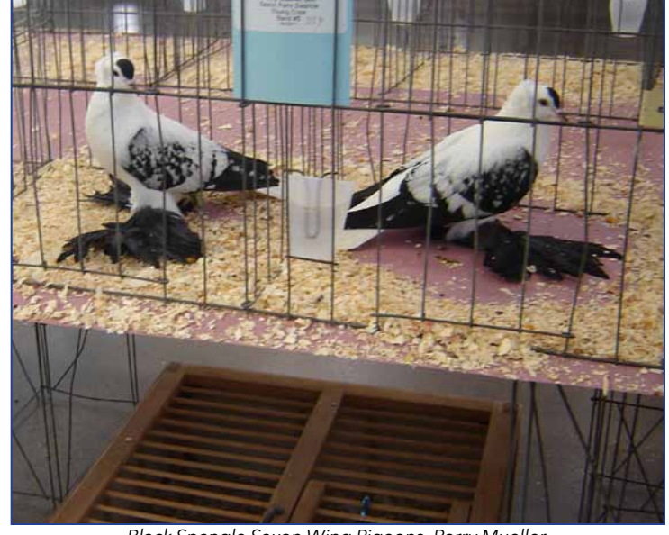
Black Spangle Saxon Wing Pigeons, Perry Mueller