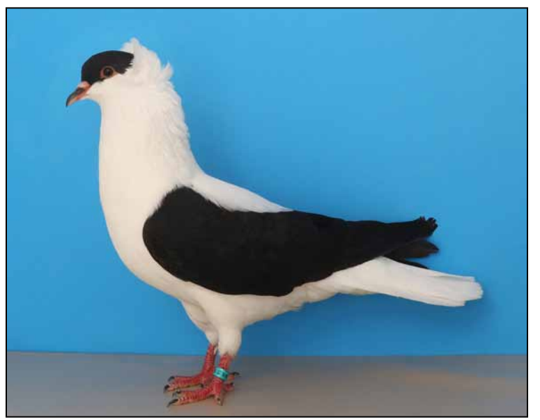
Champion Swallow & Reserve Champion Rare Breed Black Thuringer Swallow #412 rated HS96; Brad Stuckey