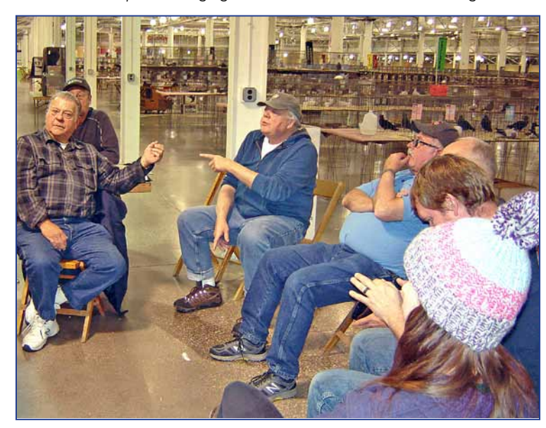
USC Annual Meeting