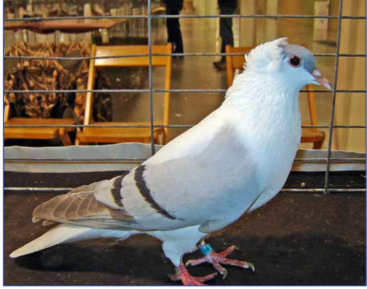
Best Thuringer Swallow, Silver YH 414 (95) Brad Stuckey