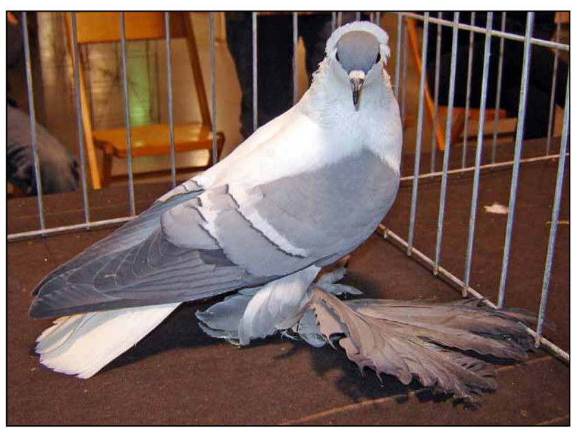
Reserve Champion Swallow: Blue WB FullHead Swallow YH 348; Perry Mueller