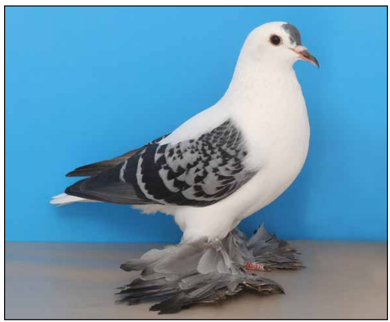
Best Silesian Swallow, (95) Rachel Stuckey